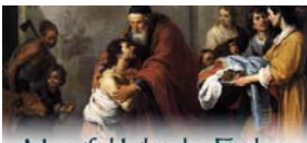
Merciful Like the Father