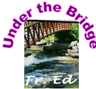
I HOPE YOU DANCE