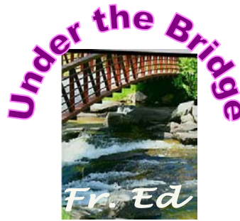
I HOPE YOU DANCE